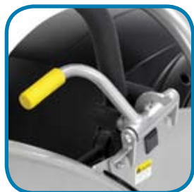
Foot pedal locking mechanism