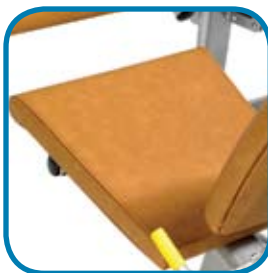
Large seat base