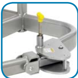
Locking plunger adjustment