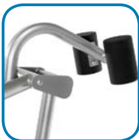
Counterbalanced input arm