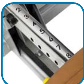
Laser cut numbering