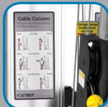
Large print and graphic exercise instructions