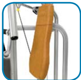
Upright seat back support