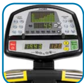
Raised console iconography