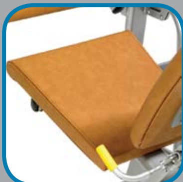
Large seat base for stability