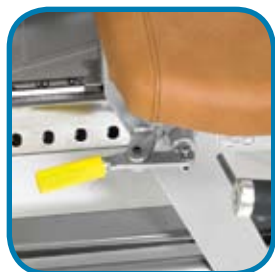
Central seat adjustment