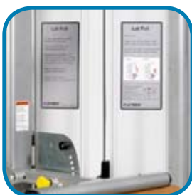
Instructions at seated height