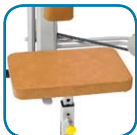
Large seat base