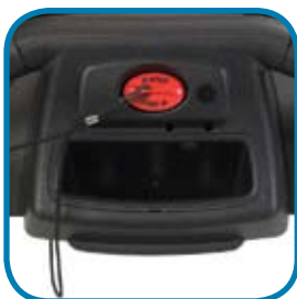
Emergency stop lanyard