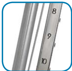
Laser cut numbers