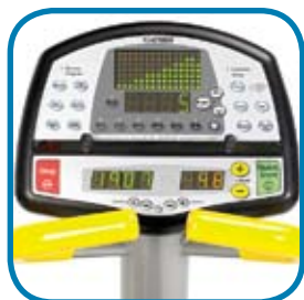
Raised console iconography