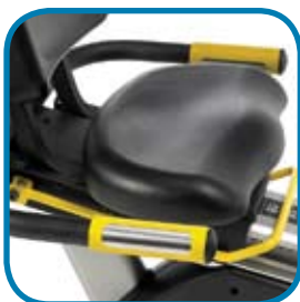
Easy access handlebars