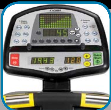
Raised iconography on main console controls