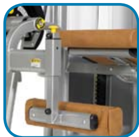
Adjustment for tibia length pad