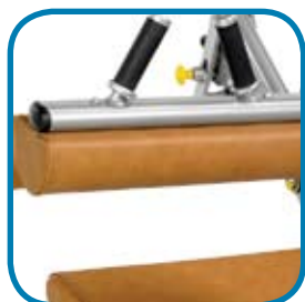
Thigh pad clamping mechanism