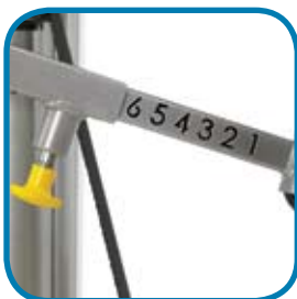
Adjustable input arm