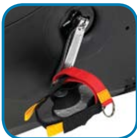
Unicam pedals with heel straps