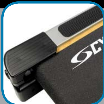
Colour contrasted belt and deck