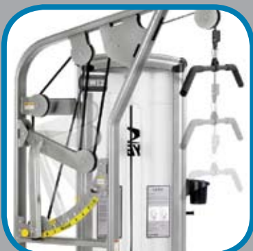
Handle start height adjustment