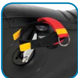
Unicam pedals with heel straps