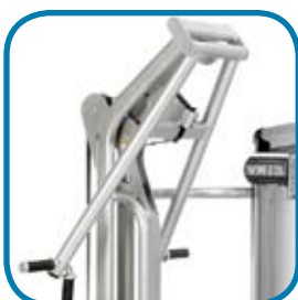
Top mounted input arm pivot