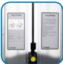
Instructions at seated height