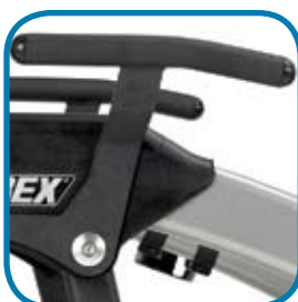
Static side handles