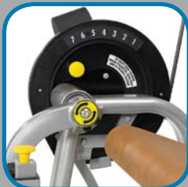
Range of movement adjustment