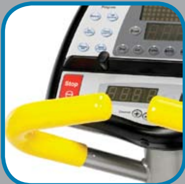
Colour contrasted easy access handlebars