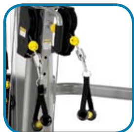
Large stability handles