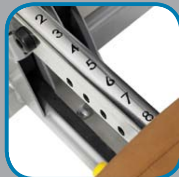
Laser cut numbers for easy seat positioning