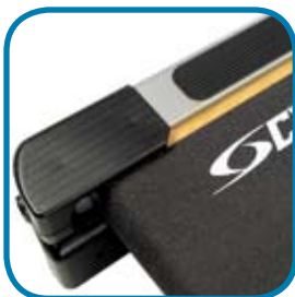
Colour contrasted deck & belt