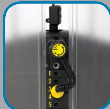
Twist select low increment weights