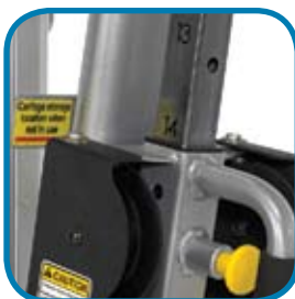
Height adjustment lever