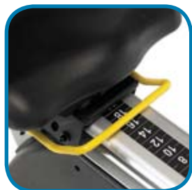
Central seat adjustment