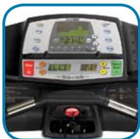
Raised console iconography