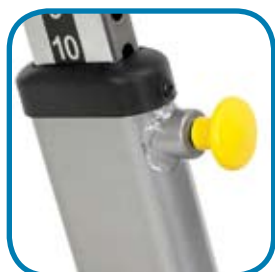
Central adjustment for saddle