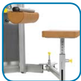
Adjustable knee restraint