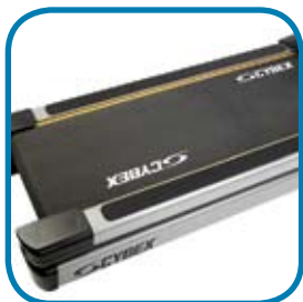
Multiple belt logos