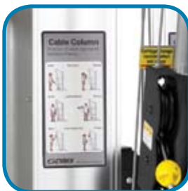
Large type instructions