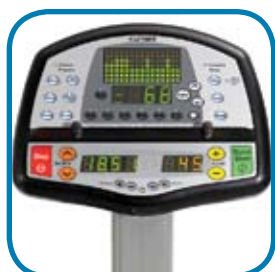
Raised console iconography