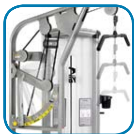
Bar handle height adjustment