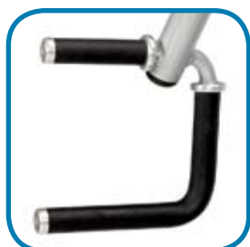
Choice of handle positions