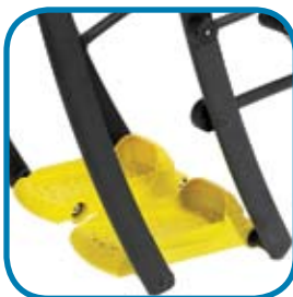
Colour contrasted foot pedals