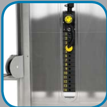
Raised weight stack numbering