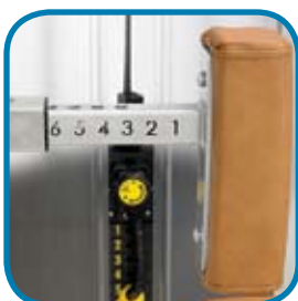
8 position reversible chest pad