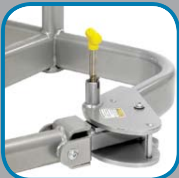
One handed locking seat adjustments