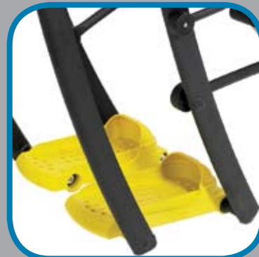
Large locking foot pedals for mounting/dismounting