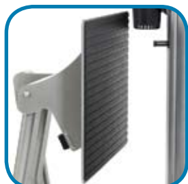
Large foot plate