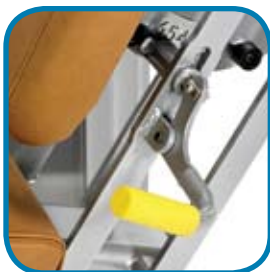
Seat back adjustment lever