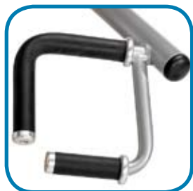
Choice of handle positions