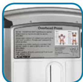
Large type instructions