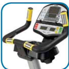
Colour contrasted handlebars